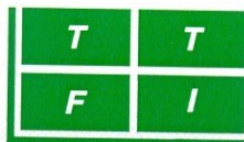
TABLE TENNIS FEDERATION OF INDIA