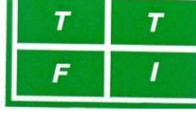
TABLE TENNIS FEDERATION OF INDIA