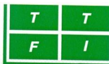
TABLE TENNIS FEDERATION OF INDIA